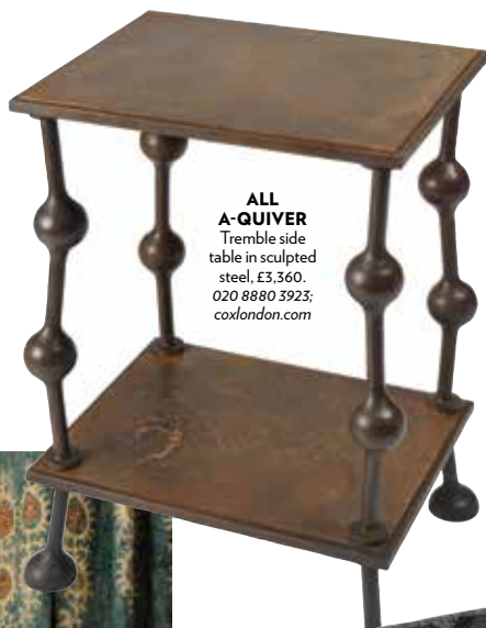
ALL A-QUIVER Tremble side table in sculpted steel, £3,360. 020 8880 3923; coxlondon.com