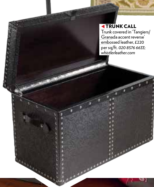
▲ TRUNK CALL Trunk covered in 'Tangiers/Granada accent reverse' embossed leather, £220 per sq/ft. 020 8576 6633; whistlerleather.com