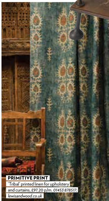
PRIMITIVE PRINT 'Tribal' printed linen for upholstery and curtains, £97.20 p/m. 01453 878517; lewisandwood.co.uk