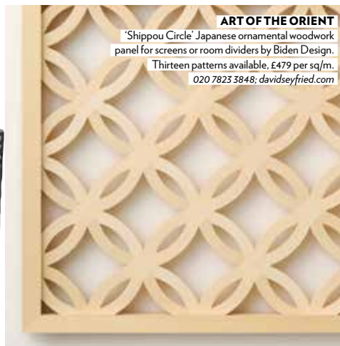
ART OF THE ORIENT 'Shippou Circle' Japanese ornamental woodwork panel for screens or room dividers by Biden Design. Thirteen patterns available. £479 per sq/m. 020 7823 3848; davidseyfried.com