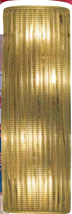
▲ OFF THE WALL Odeon wall light in gilt glass and nickel, £1,210. 020 7351 2567; richardtaylor designs.co.uk