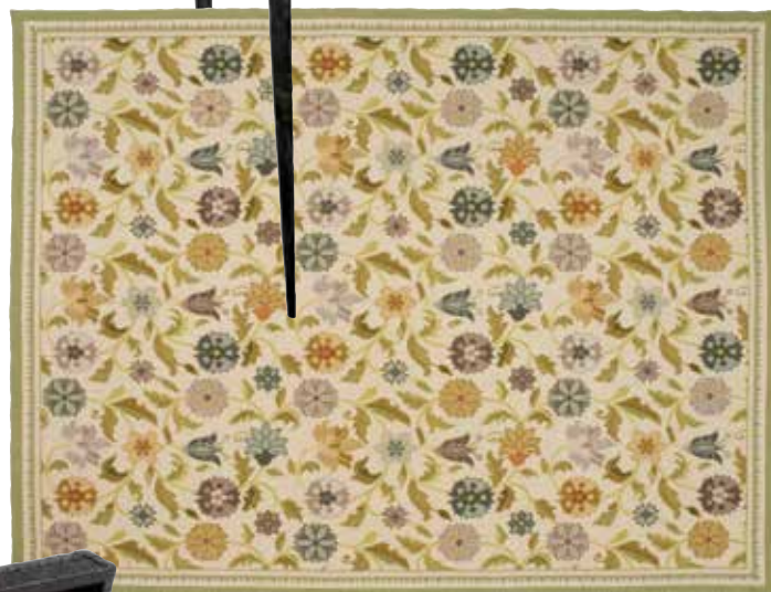
▼ OUT OF AFRICA 'Gambia' handmade tapestry rug in pure wool using natural dyes, 3m x 2m, £3,000. 020 8780 5288; atlanticorugs.com