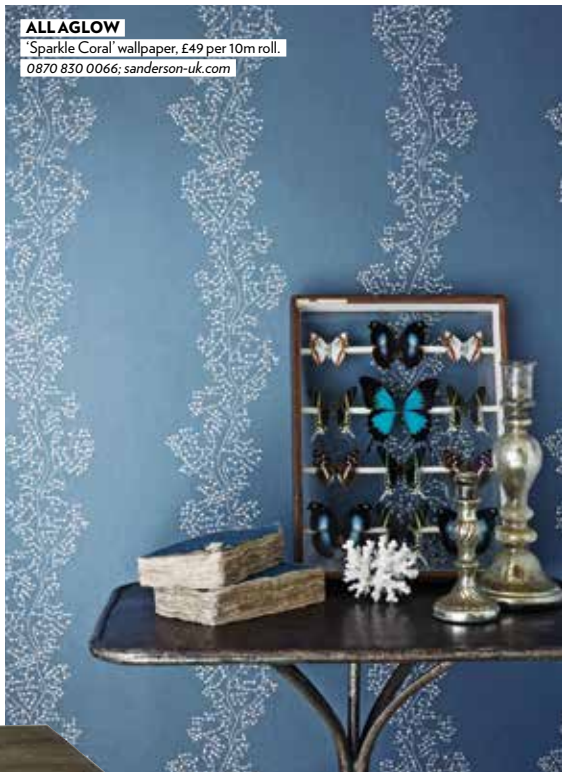
ALL AGLLOW 'Sparkle Coral' wallpaper, £49 per 10m roll. 0870 830 0066; sanderson-uk.com